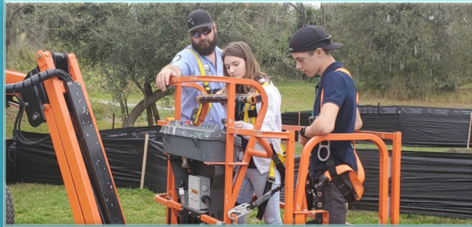
BUILDING AND CONSTRUCTION TECHNOLOGIES or ELECTRICITY